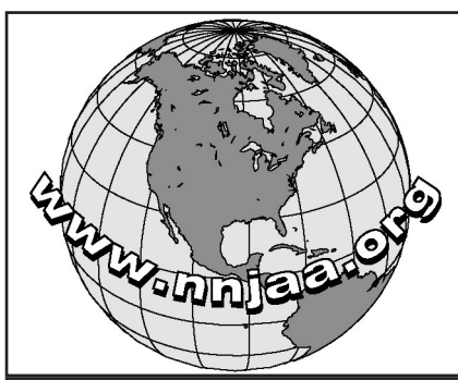
Member area userid: alcoholic password: onedayatatime

District 42 - 2nd Sunday 9:00am, 120 Jersey Ave. 2nd floor, New Brunswick