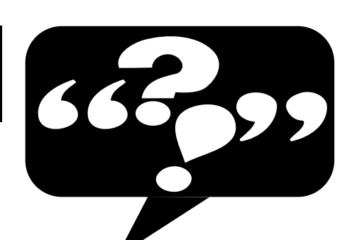
SPEAK OUT! This Day Newsletter provides this forum for individual AA's viewpoints and opinions. The opinions expressed here are individual opinions only and not necessarily the opinions of This Day , Area 44, North Jersey Intergroup, or AA as a whole. We welcome your comments, opinions or viewpoints on anything found in this newsletter. — The Editor

As I close out my Service this year as your Convention Chair - I want to personally invite each and every one of you to come experience the Convention for yourself. If you have registered already - we thank you!